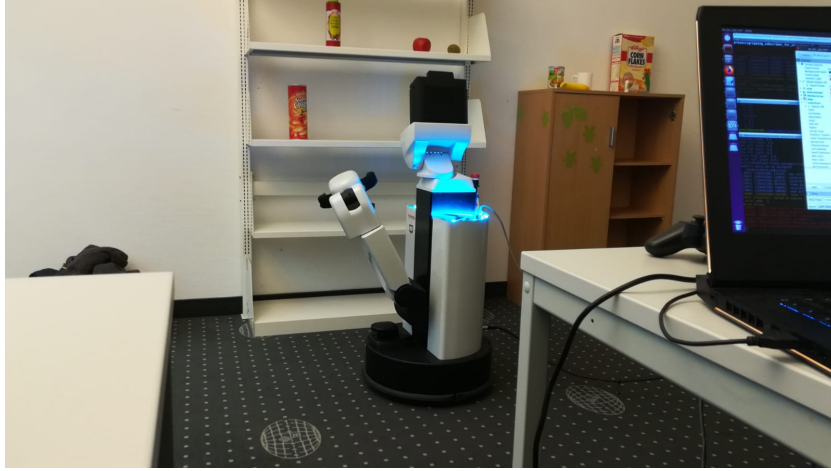
Fig. 2. Toyota Human Assistance Robot (HSR) scanning the shelf

Task 1: Setup Our system will start by autonomously creating a semantic mapping of the environment based in the domain rich knowledge representation provided by KnowRob. To move the robot to the most promising, generated viewpoint, the pose is passed to Giskard as a goal pose.