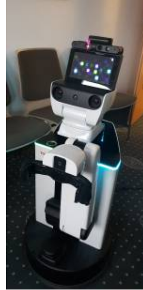
Fig. 4. Toya @ Institute for Artificial Intelligence