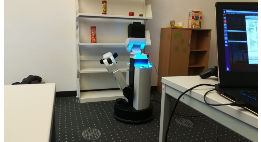
Fig. 2. Toyota Human Assistance Robot (HSR) scanning the shelf

Task 1: Setup Our system will start by autonomously creating a semantic mapping of the environment based in the domain rich knowledge representation provided by KnowRob. To move the robot to the most promising, generated viewpoint, the pose is passed to Giskard as a goal pose.