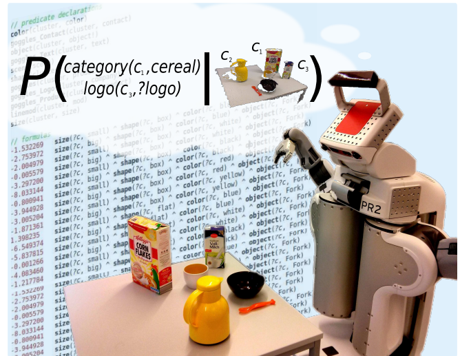
Fig. 1: PR2 looking at a breakfast table.

different perceptual characteristics. In most cases, scenes were simplified to account for the perceptual capabilities of the robot.